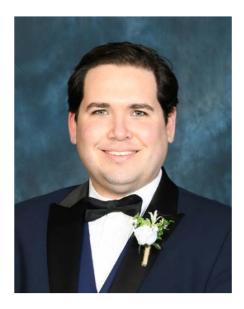
From the South