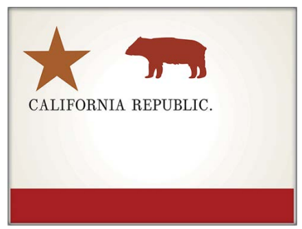
The Original Bear Flag of California

California was formally annexed to the United States in 1848 and became the 31<sup>st</sup> state in 1850. A modified version of the Bear Flag became the official state flag in 1911.